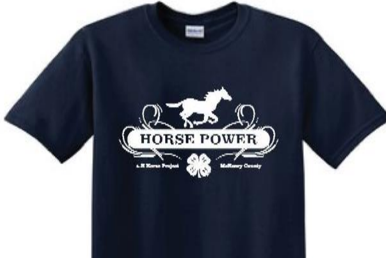
Gildan Heavy Cotton T-shirt is Navy with white imprint on front

Show your support of 4H and your membership in the horse and pony program. Buy a shirt***